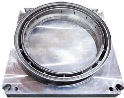
Engine leaf ring structure 316L stainless steel φ 400*60mm 3