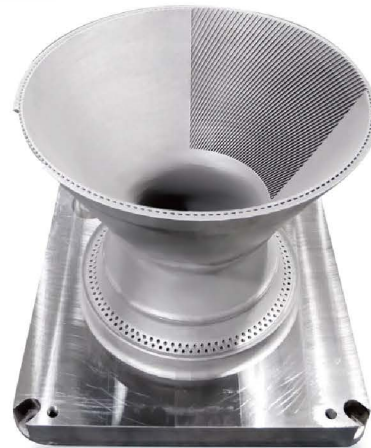
TC4 titanium alloy φ 393*340mm 3