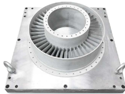
Engine turbine casing assembly IN718 high temperature alloy φ 410*240mm 3